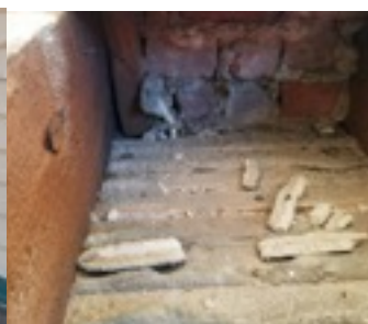
Above: unusual brick infill at the meeting of the second floor joists and outside wall