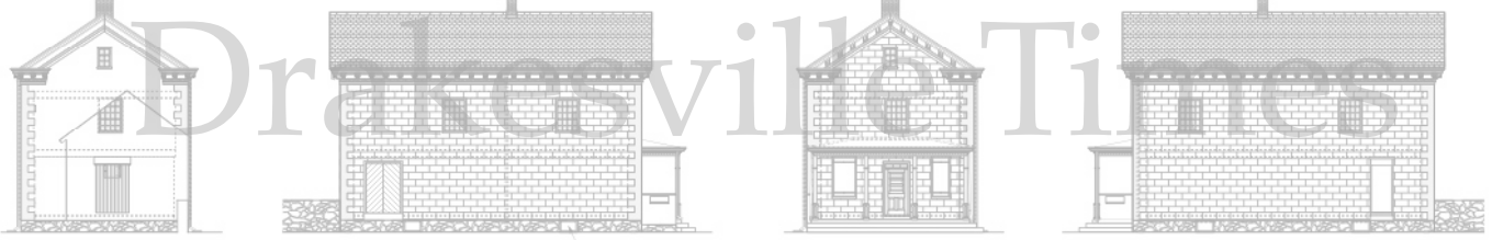
EXTERIOR ELEVATION - NORTH Scale: 1/8" = 1'-0"