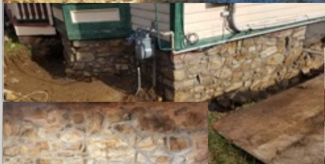
Repointed basement wall with ghost of old doorway